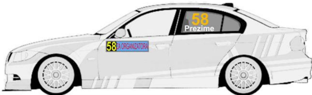
Zadnjim levim i desnim bočnim staklima, broj je visine 20cm sa debljinom linije od 2.5cm, font je Arial BOLD

Boja ovih brojeva je florescentno narandžasta i to PMS 804