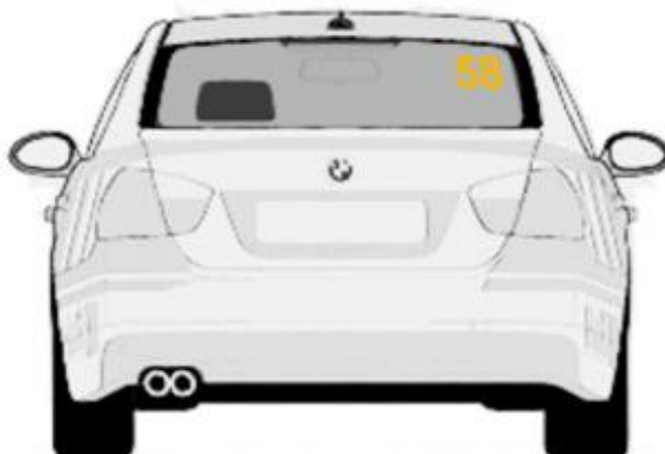
Zadnjem vetrobranskom staklu. broj je visine 14cm sa debljinom linije od 2cm, font je Arial BOLD