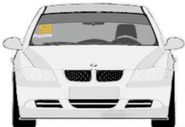
Prednjem vetrobranskom staklu. broj je visine 14cm sa debljinom linije od 2cm, font je Arial BOLD