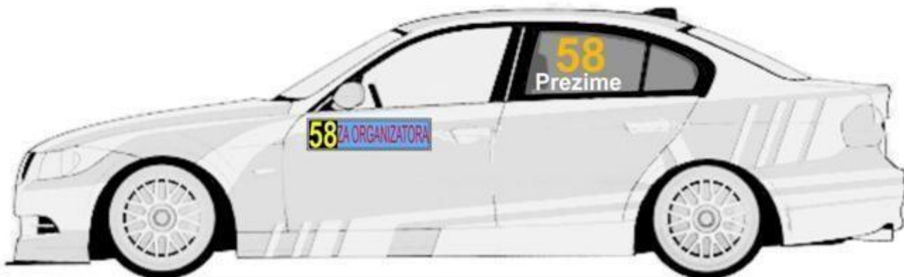
Zadnjim levim i desnim bočnim staklima, broj je visine 20cm sa debljinom linije od 2.5cm, font je Arial BOLD

Boja ovih brojeva je florescentno narandžasta i to PMS 804