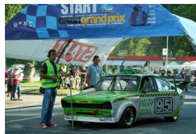
Winners of previous GRAND PRIX CAZIN races: